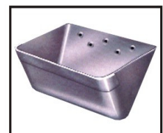
Technical Specification chart for Bucket Bolt